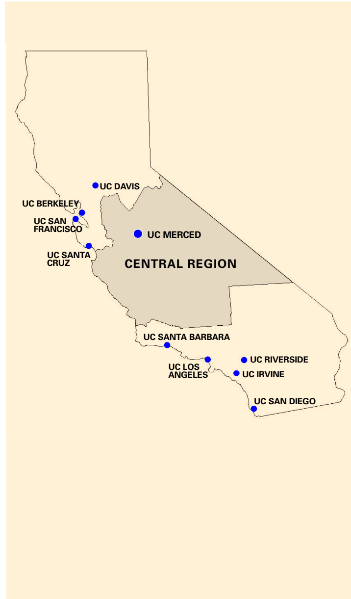
Fig. 2.1 UC Merced Location